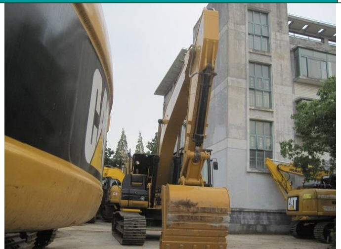
Machine view(Right side lamp missing)

This report only reflects the truth of quality in this lots goods, based on statistical sampling procedure. Inspection is performed to the best of our ability and skills but without responsibility on our part, nor does it evidence shipment. Our Website: www.qgs.com.cn