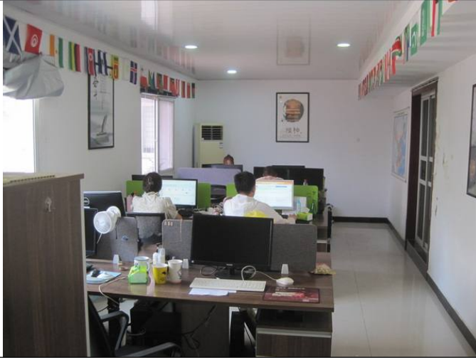
The office view