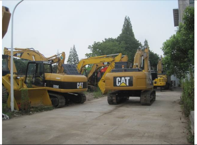
The factory view