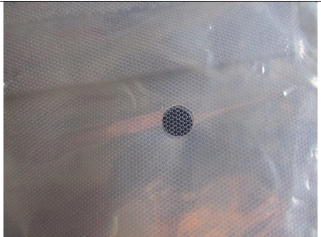
Safe air hole on polybag