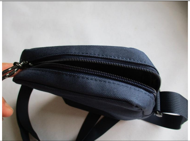
Zipper function test