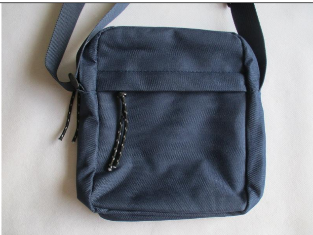
Blue shoulder bag view