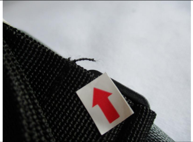
Untrimmed thread - Minor