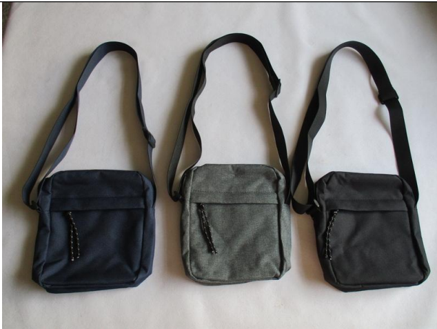
Shoulder bag view