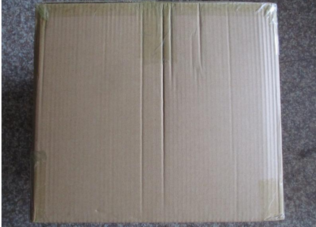
No print side carton shipping mark