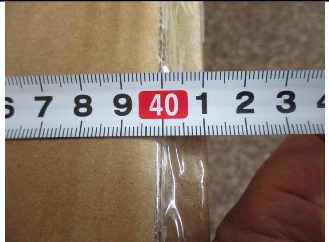
Length: 41 cm