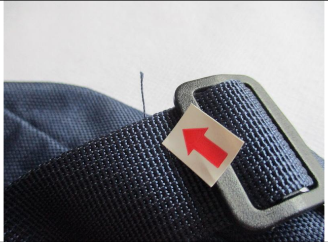
Untrimmed thread - Minor