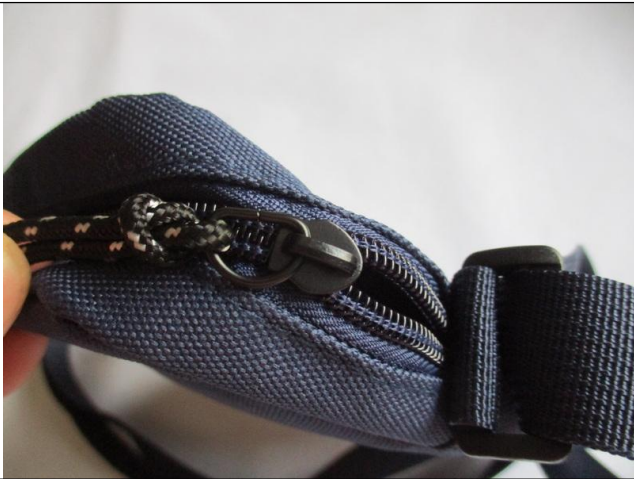
Zipper function test