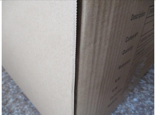
Glued on master carton jointed