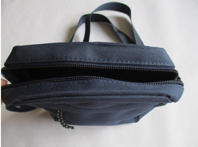
Blue shoulder bag view