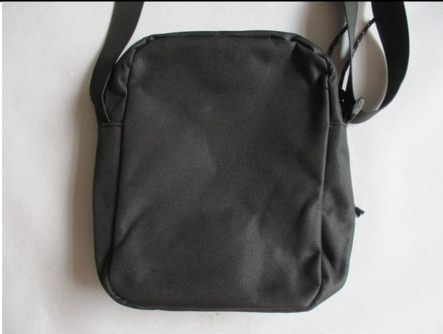
Black shoulder bag view