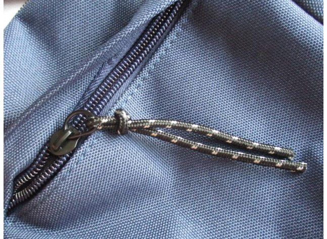
Blue shoulder bag view