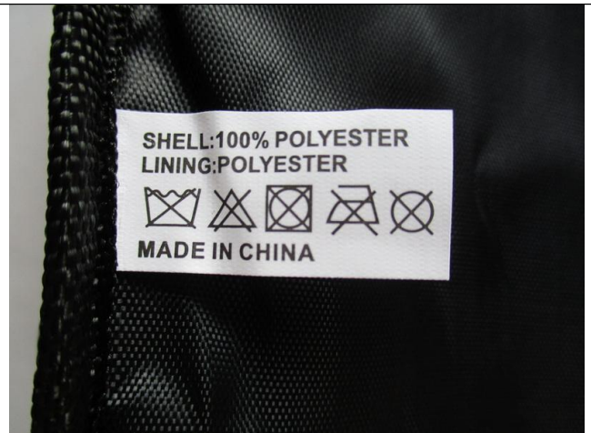
Sew label view