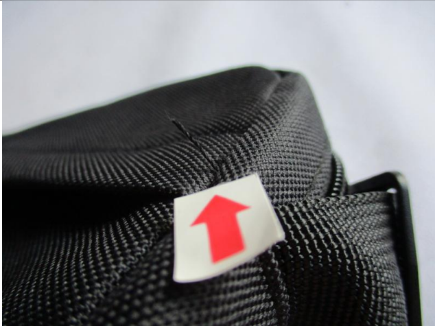
Untrimmed thread - Minor