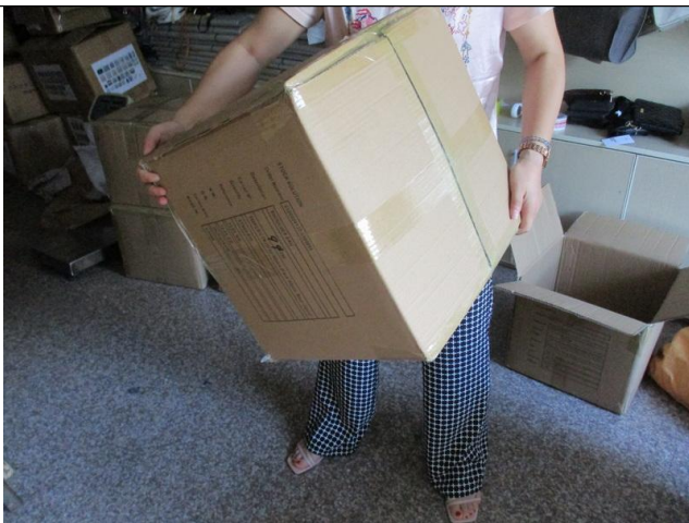
Carton drop test