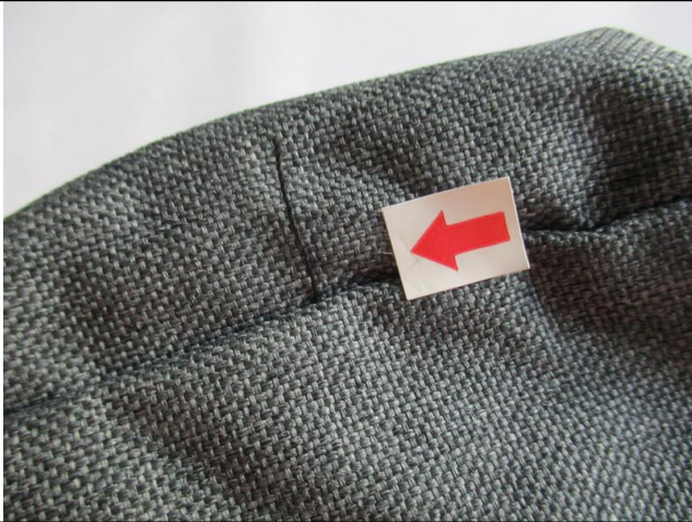
Untrimmed thread - Minor