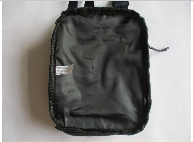
Blue shoulder bag internal view