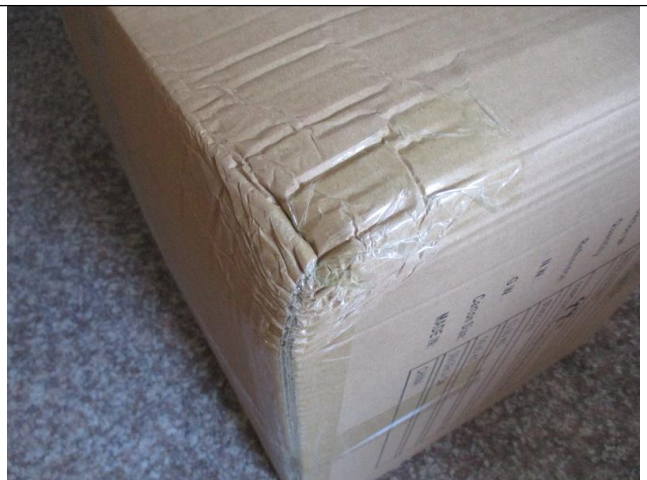
Carton drop test