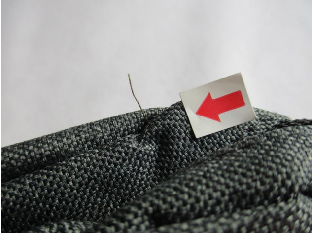
Untrimmed thread - Minor