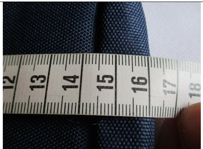
Length: 14.5 cm