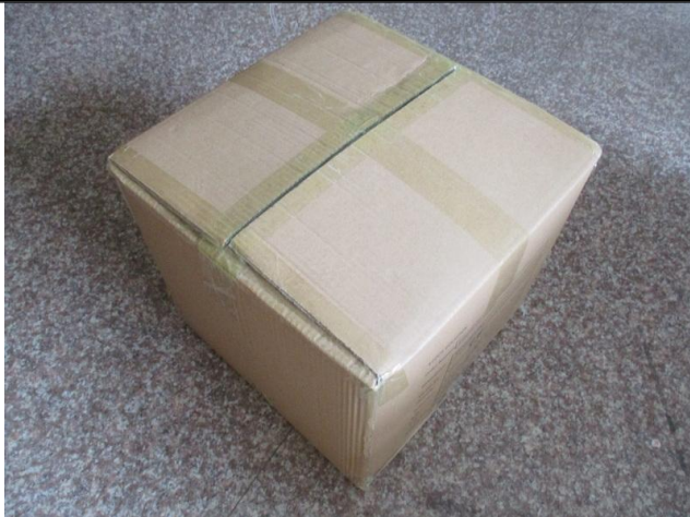
Master carton view