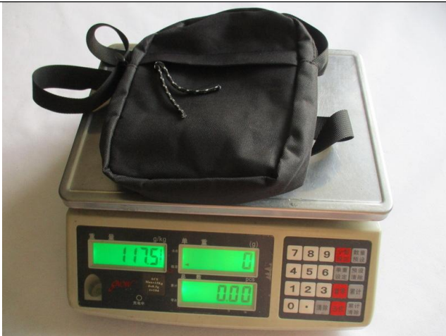
Black shoulder bag N.W.: