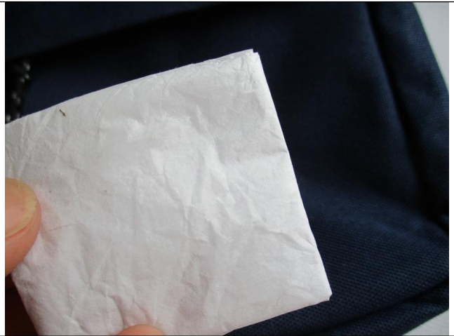
Material color rub test