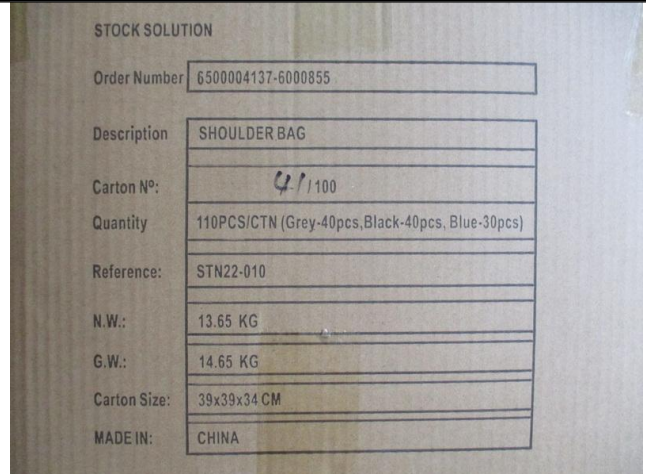
Main carton shipping mark