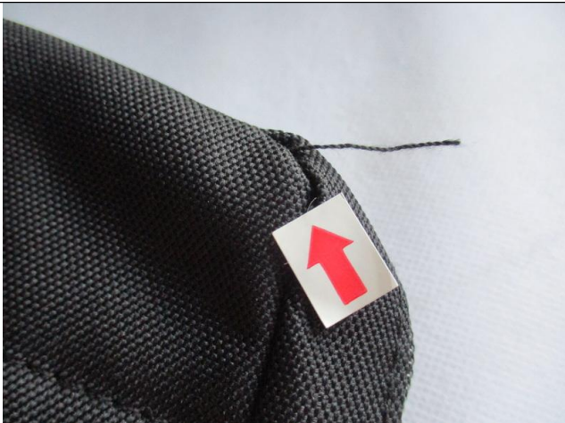
Untrimmed thread - Minor