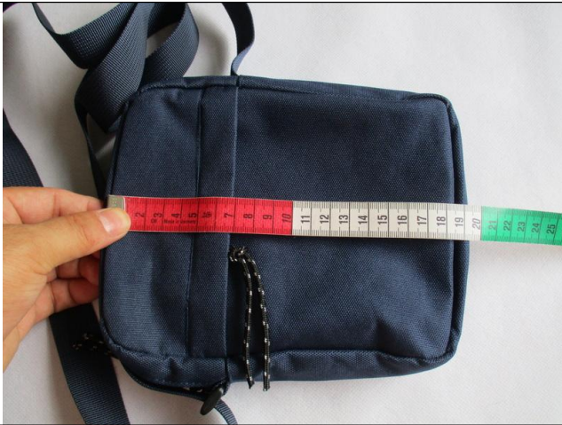
Shoulder bag size