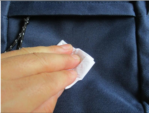
Material color rub test