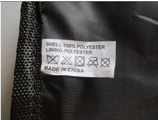
Sew label view