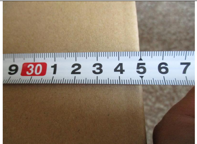
Height: 35 cm