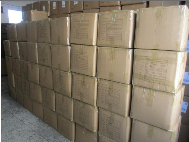
Warehouse stacking view