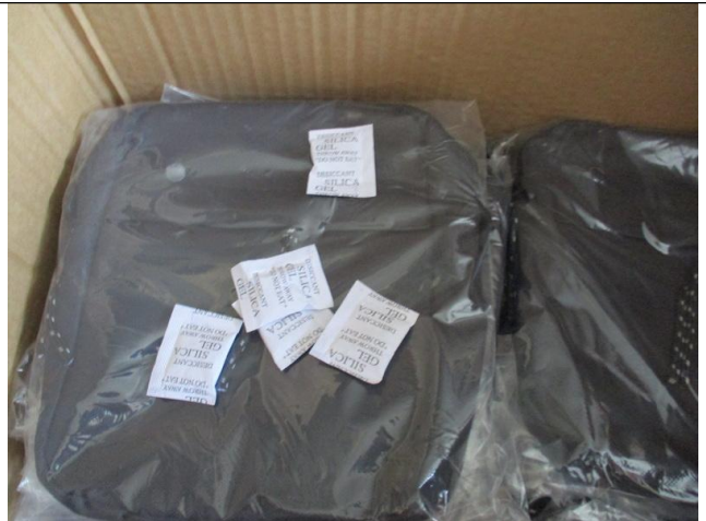
Carton packing view