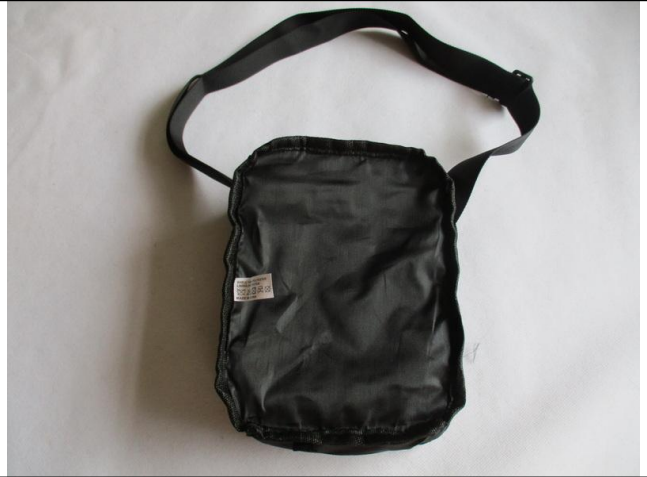
Gray shoulder bag internal view