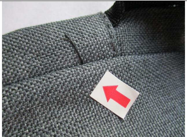
Untrimmed thread - Minor