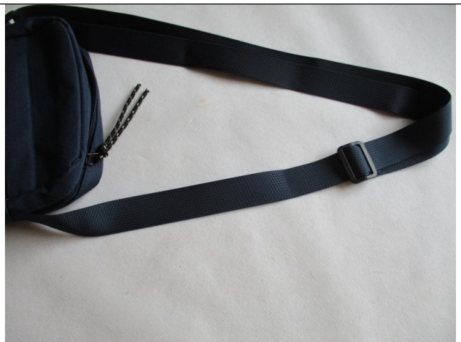
Shoulder belt adjustable test