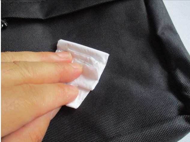
Material color rub test