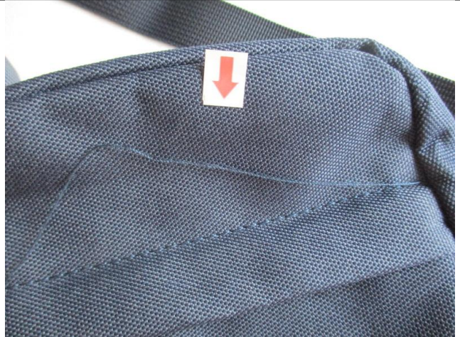
Untrimmed thread - Minor