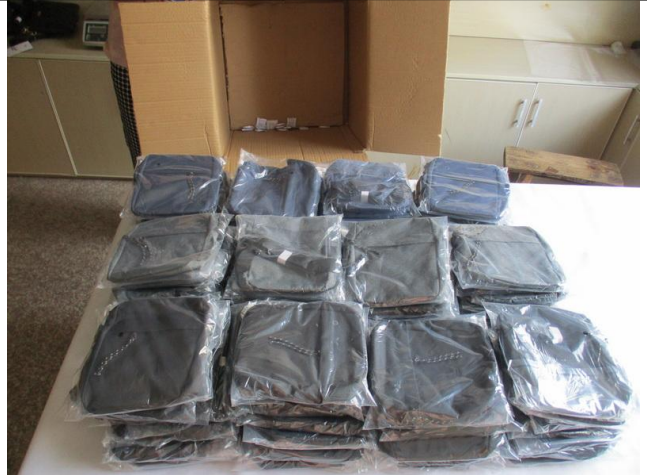
30pcs blue + 40pcs Gray + 40pcs black per carton