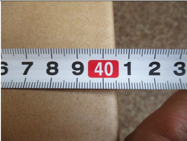
Width: 40.5 cm