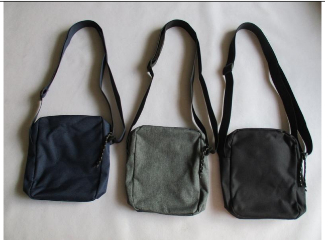
Shoulder bag view