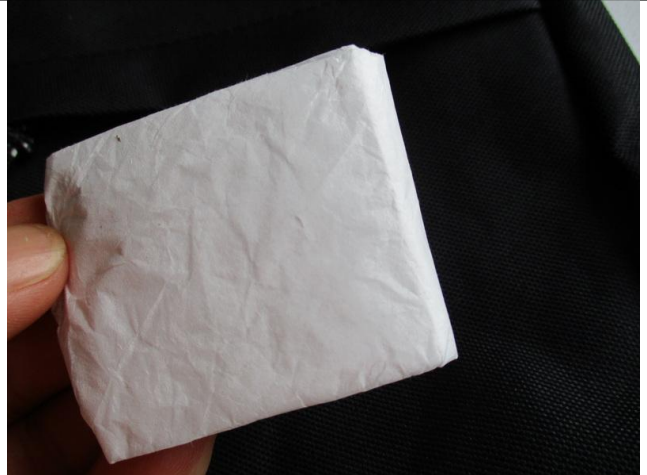
Material color rub test