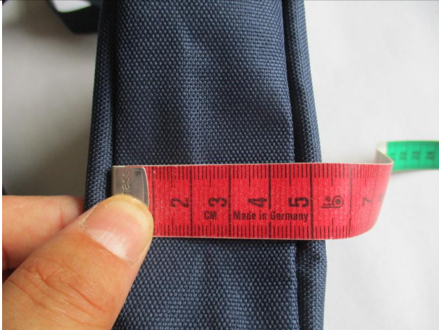
Shoulder bag size