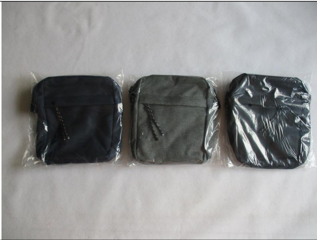
Product packing view