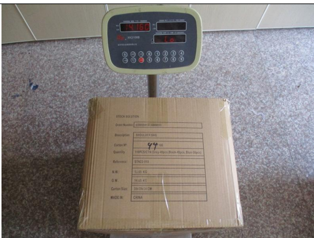
Master carton packing G.W.: