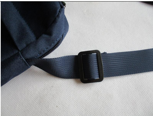
Shoulder belt adjustable test