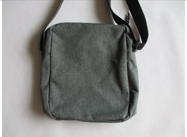
Gray shoulder bag view