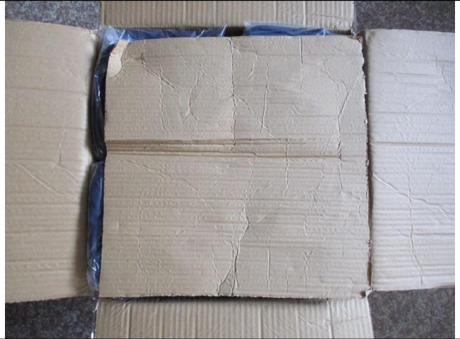
Open master carton packing view