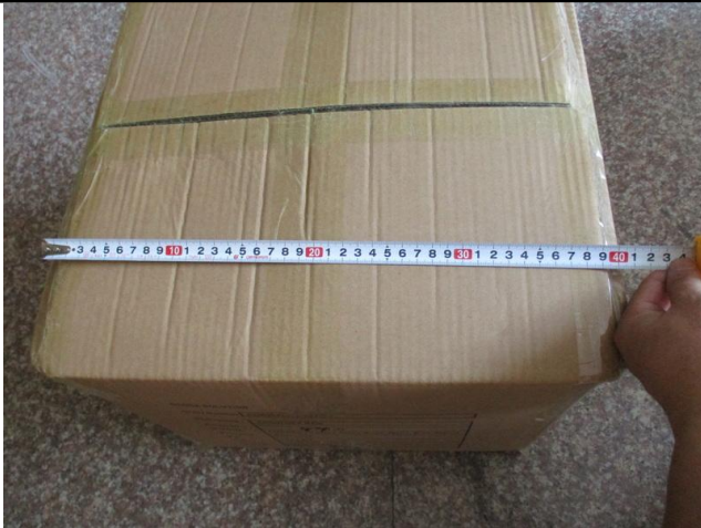
Master carton size