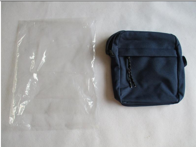
Each unit in a polybag packing