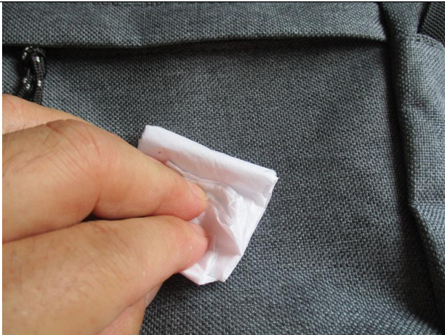
Material color rub test