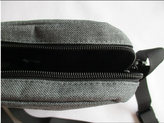
Gray shoulder bag view