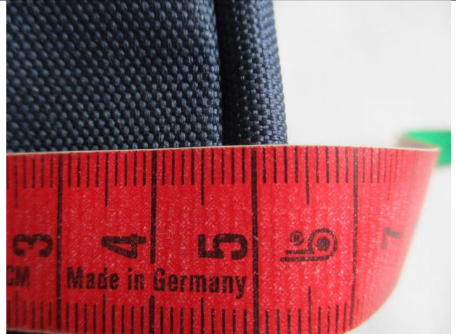
Width: 4.7 cm