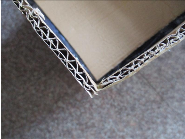
Master carton with 5 Ply