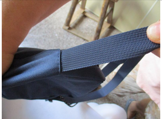
Stitched pull test