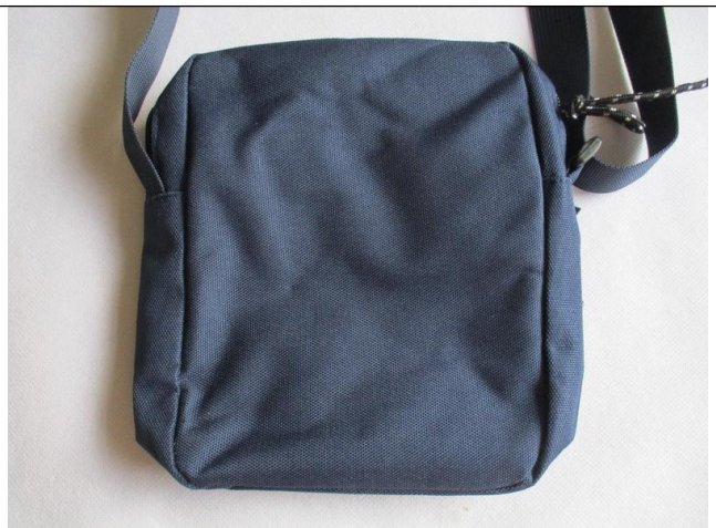
Blue shoulder bag view