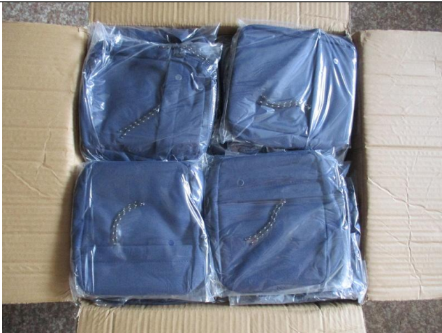
Carton packing view