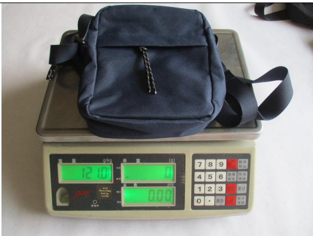
Blue shoulder bag N.W.: