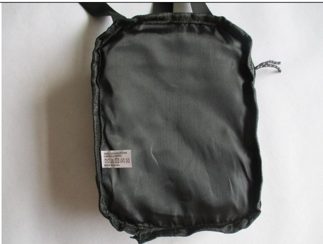
Black shoulder bag internal view