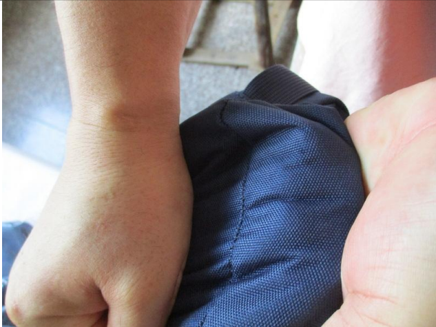
Stitched pull test