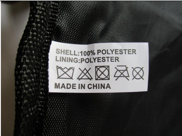
Sew label view