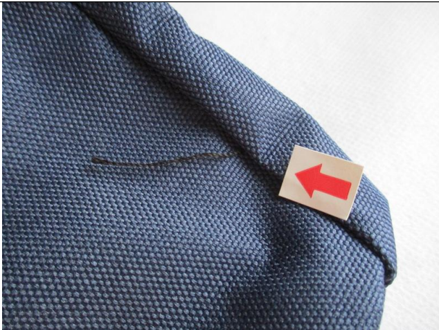
Untrimmed thread - Minor