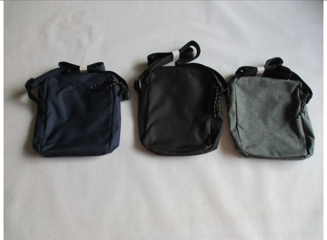
Shoulder bag view