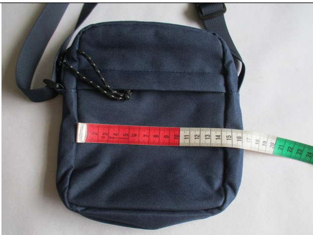
Shoulder bag size