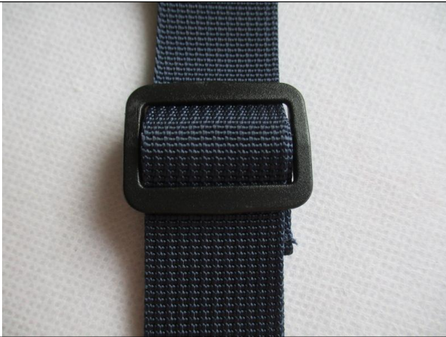
Blue shoulder bag view