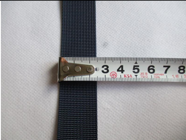
Shoulder belt size