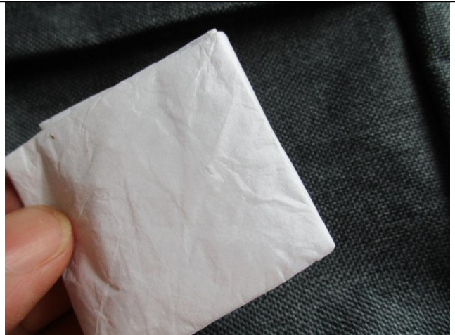
Material color rub test