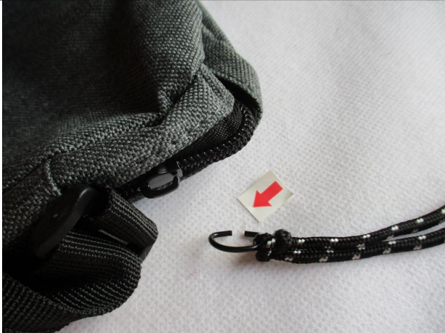
Zipper deformed came off - Major