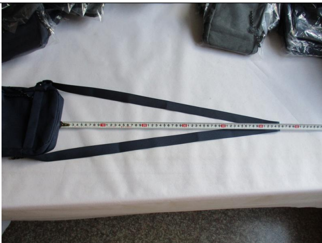
Shoulder belt size