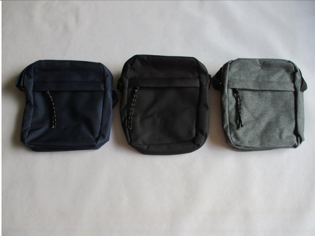
Shoulder bag view