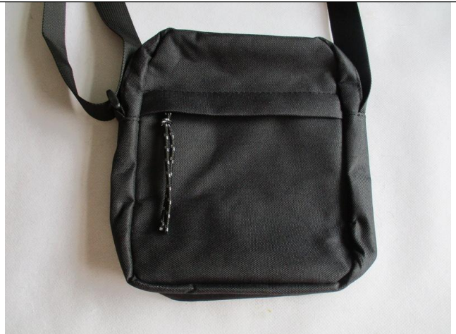
Black shoulder bag view