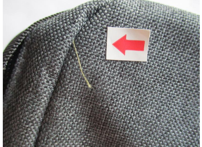
Untrimmed thread - Minor