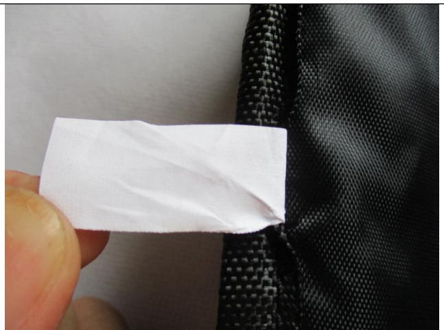
Sew label view