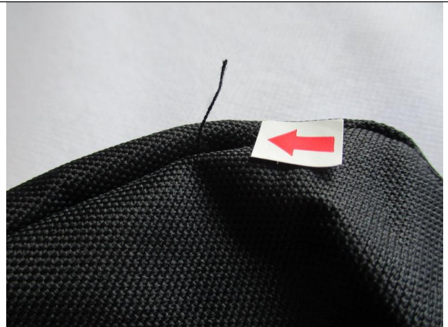
Untrimmed thread - Minor