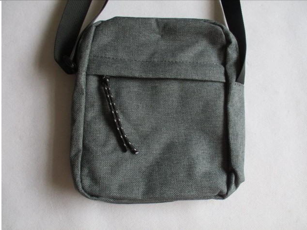
Gray shoulder bag view