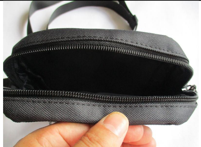
Black shoulder bag view