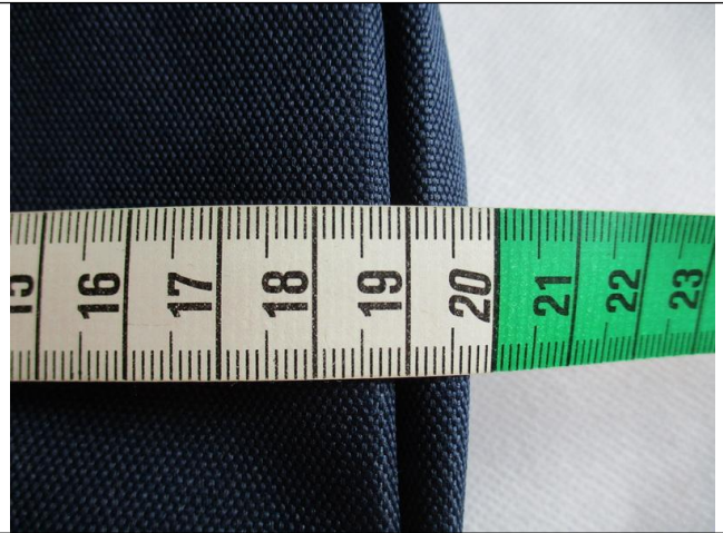
Height: 19 cm