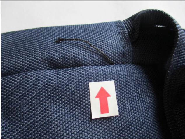
Untrimmed thread - Minor