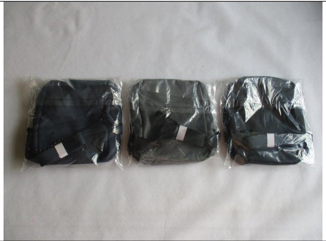
Product packing view