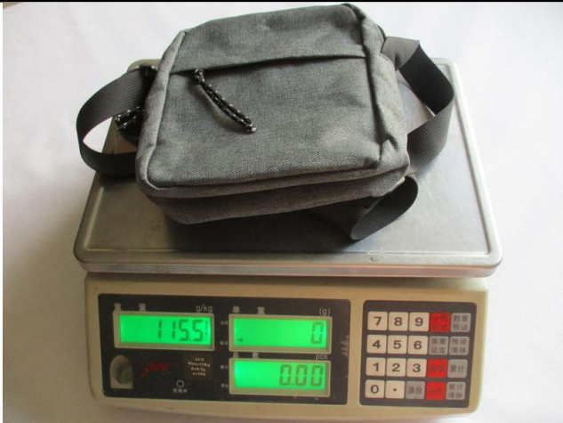
Gray shoulder bag N.W.: